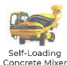
Self-Loading Concrete Mixer