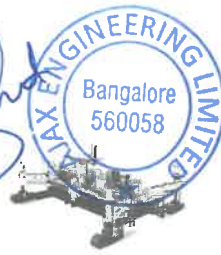
Concrete Slip-Form Paver